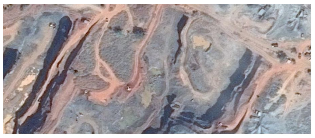
Figure 3 Basalt rock mining activity near by Rajmahal hill

Rajmahal hill is composed of basalt. Basalt is highly susceptible to weathering. It has been noticed that weathered mantle on upland quickly discharge its water through spring and drainage. The study of grace data in term of mass anomaly has revealed that during monsoon the terrain has retained high amount of water. Present study is based on mass variability within three months. Change in mass in very high in these three months. May is the month of dry in which the mass deficiencies high, where as July is the month of rainfall in which increase of mass is noticed. Jharkhand receives its all precipitation during monsoon which stats in the month of June every year.